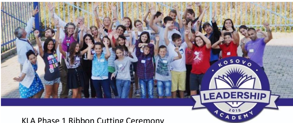
KLA Phase 1 Ribbon Cutting Ceremony

We have just returned from Kosovo for the Ribbon Cutting Ceremony for the opening of Phase 1 of the construction on the new Kosovo Leadership Academy. Praise the Lord for what He has done! Join with us as we rejoice over what the Lord is doing in this M country and pray with us for the fund raising for Phase 2 which is a 3 story educational wing of classrooms. What a joy to see Christ lifted high and a whole generation of young people impacted for eternity!